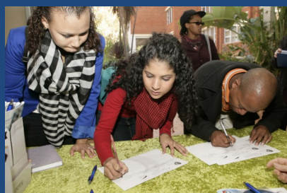
Students registering for the Research Ethics and Integrity Workshop.