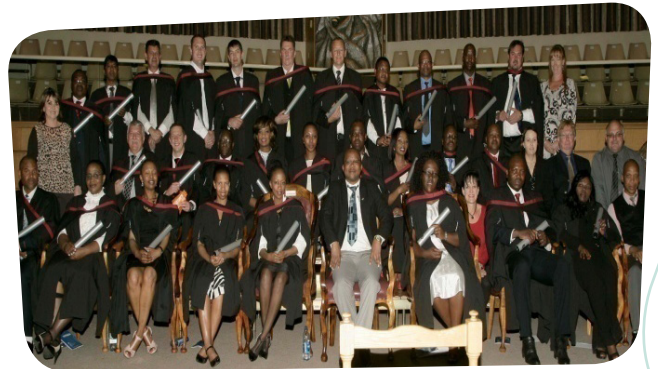
Graduation Photo of Group 2