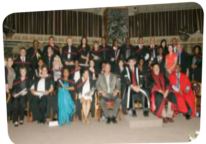
Graduation Photo Group 3