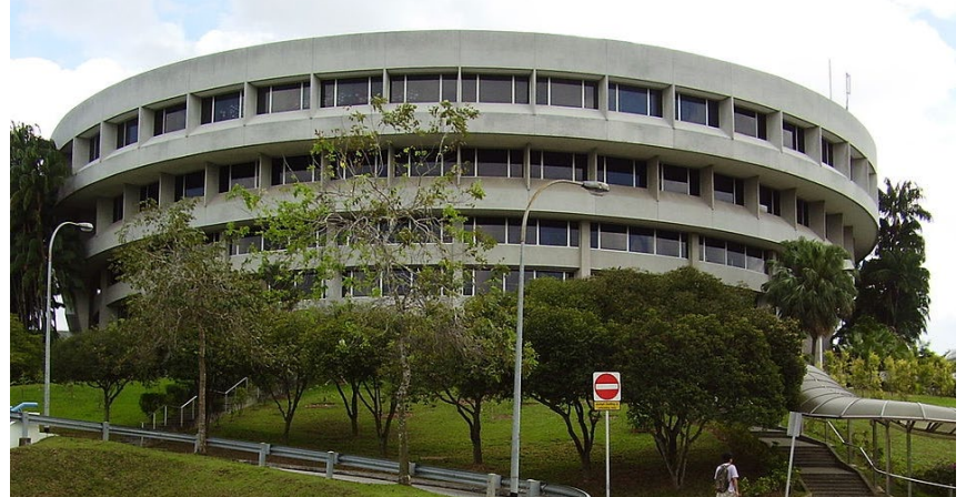
Photos of some of the libraries visited during the benchmarking tour