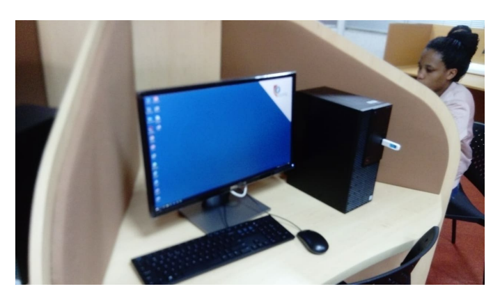
This is one of the three computers donated to the LIS via above-mentioned project.

Postgraduate Studies Office. The Yebo Project focuses on the internationalisation of doctoral education. In this project the capacitation on colleagues and students involved in the PhD lifecycle is prioritised to improve efficiency and overall institutional outputs.