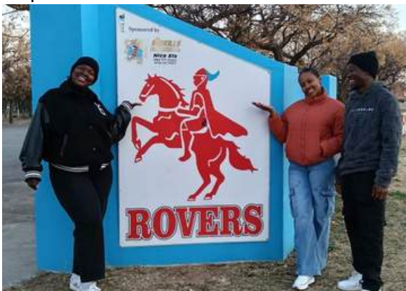
Sparks Media – a creative LPM student team working with Rovers Rugby Club in Welkom

As industry expectations evolve, so must education. This project reflects CUT's commitment to transforming WIL into a responsive, future-focused model—one that not only prepares students for the world of work but also delivers tangible value to the organisations they serve. It's a powerful demonstration of how strategic collaboration can shape future-ready graduates and strengthen community ties.